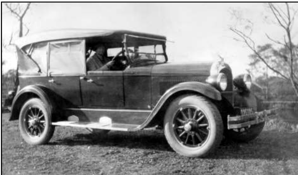
119. Our Chrysler Motor Car taken on Eagle Point Road 4 June 1929.

Miss Annie Dreier continued to live alone in the old cottage