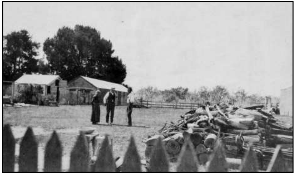
Members of the Dreier family photographed in the farm yard with outbuildings in the background.

They recorded scenes and activities around the farm and local district, and also on their trips by bicycle and train to visit relatives in the Maffra and Sale areas. In addition they bought photographs from professional photographers, and must have exchanged images