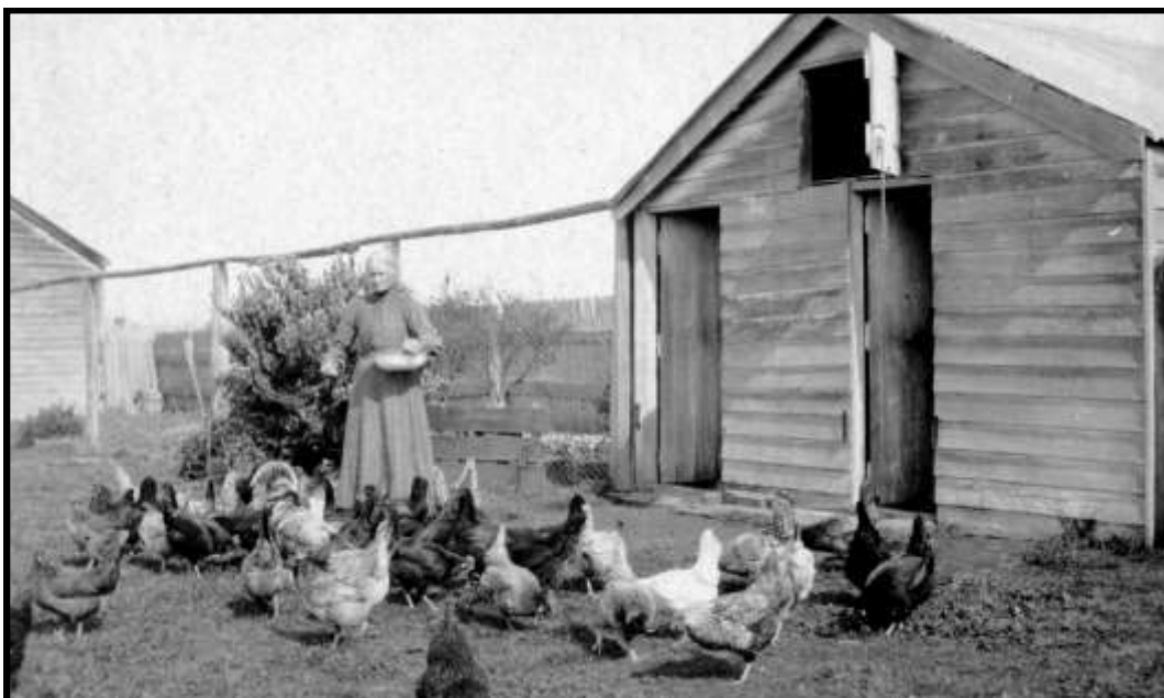
The Dreiers did not only photograph "special events" but recorded the "everyday", such as feeding the chooks.