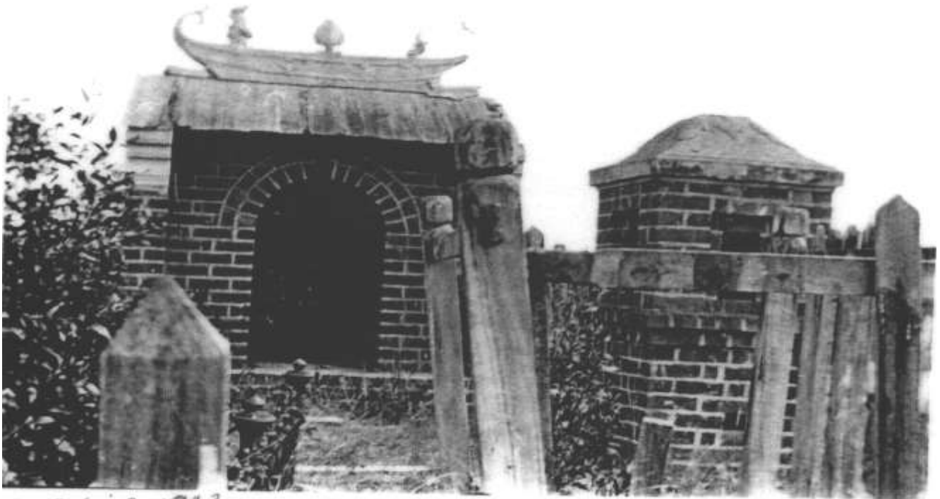
The shrine and burning tower at the Bairnsdale Cemetery in April 1923.